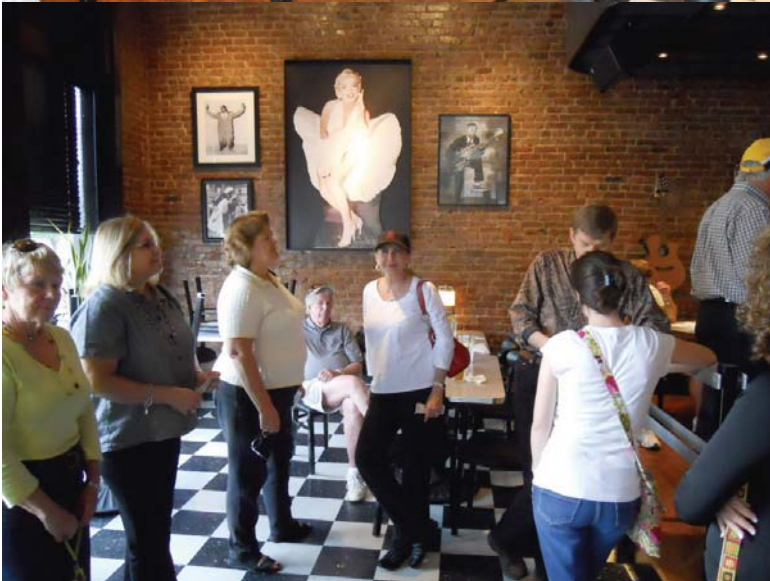
Many of our favorite ladies....chatting and.....on the wall of course!