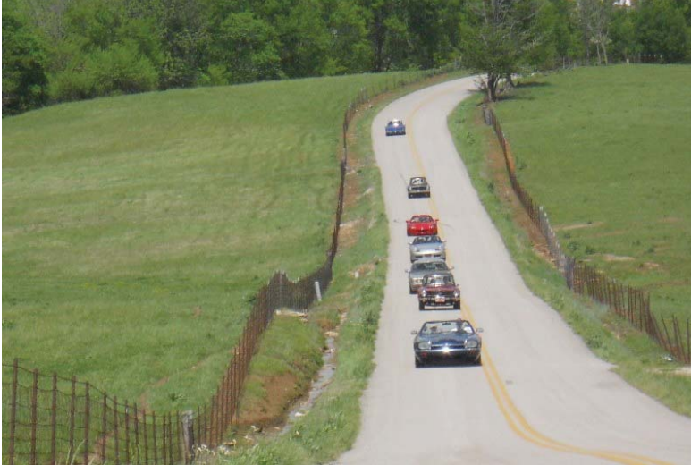
Most of the crew....too many Sunday drivers lagging somewhere back there.