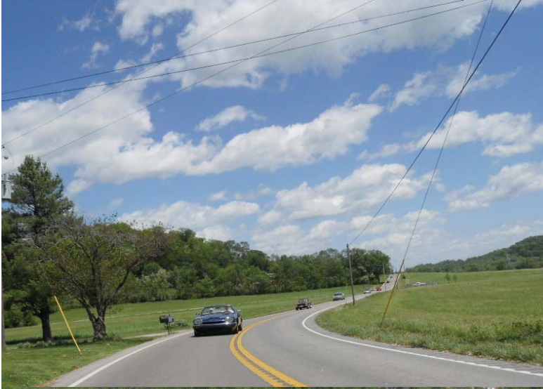
Did I mention it was a beautiful day?