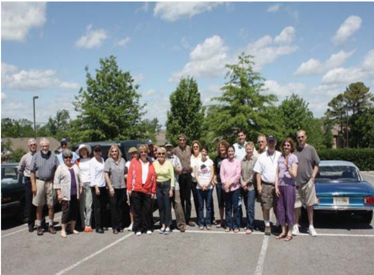
The group assembles at the "Y" which is near Franklin's Mack Hatcher/Royal Oaks intersection.

Our thanks to all that came....hope you had fun! Here are a few pics and some commentary.