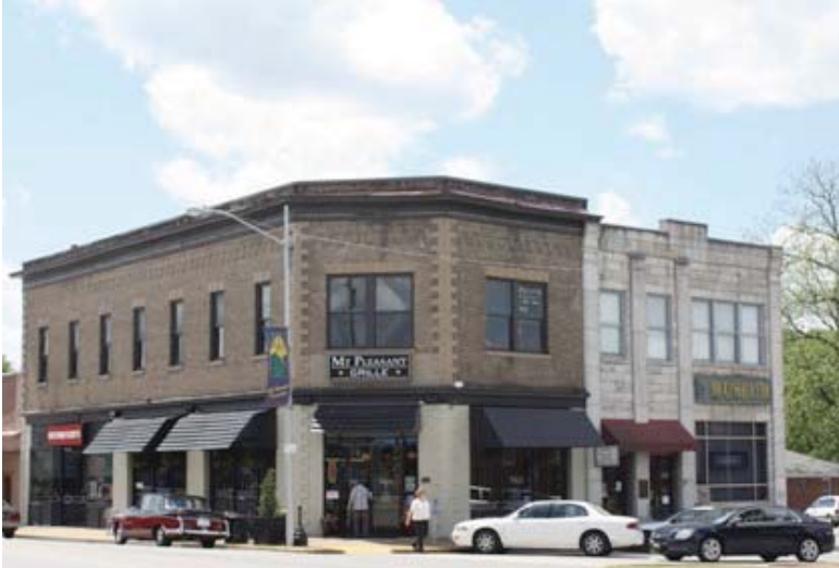
The restaurant and Museum are on the square and they are conveniently in the same block