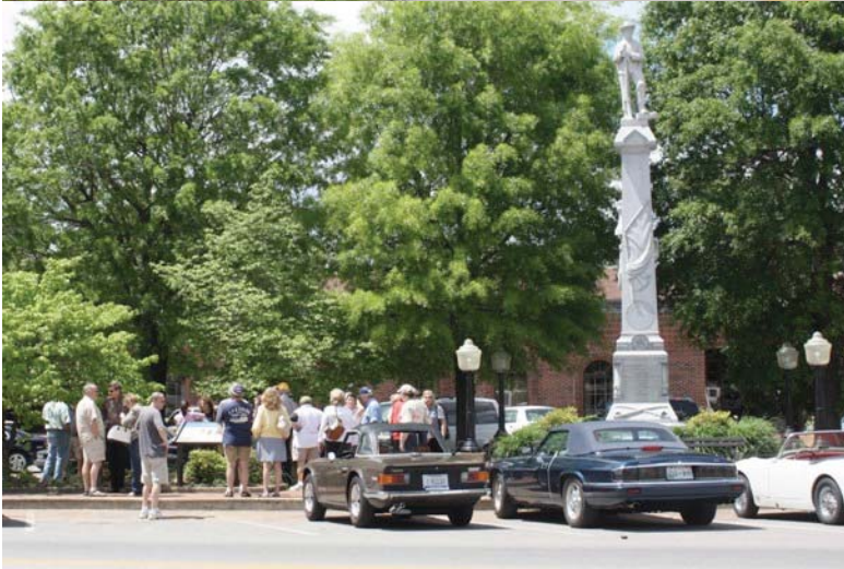
We pretty much took over the city square....and tried to be civil as the police are just across the way!