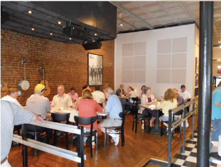
The restaurant is very well done inside and out. We thought the tipping policy a bit "stiff" but otherwise a great stop