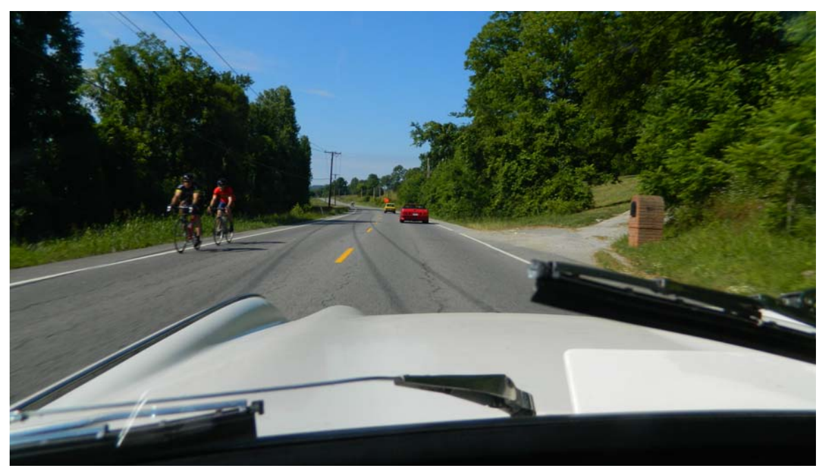
Lots of early morning cyclists on the road.