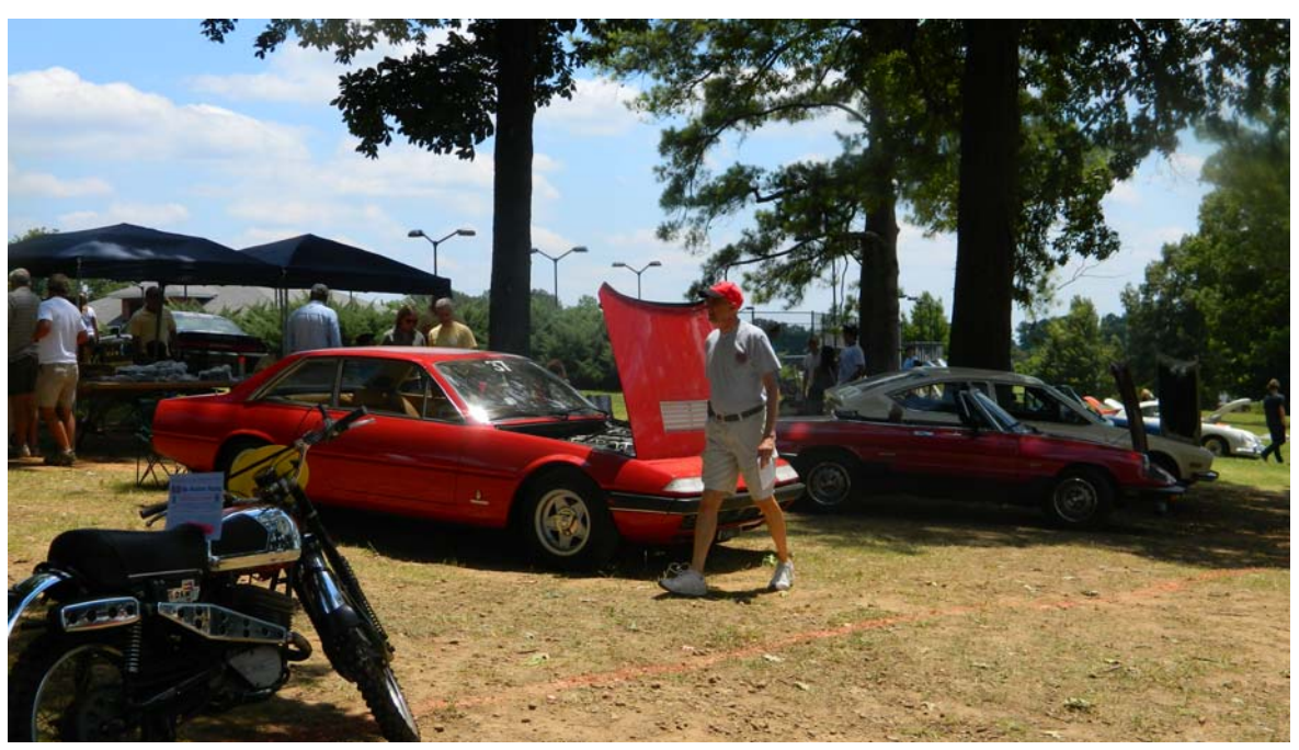
There were all types of cars. Here is a Ferrari and an Alpha Romeo

And the NBCC contingent did very well. – out of 6 cars entered, four won their classes, one won the President's Award (picked out by the club president), the same one won the Diamond in the Rough Award, and one waltzed away with The Best of Show Award – here are the winners: