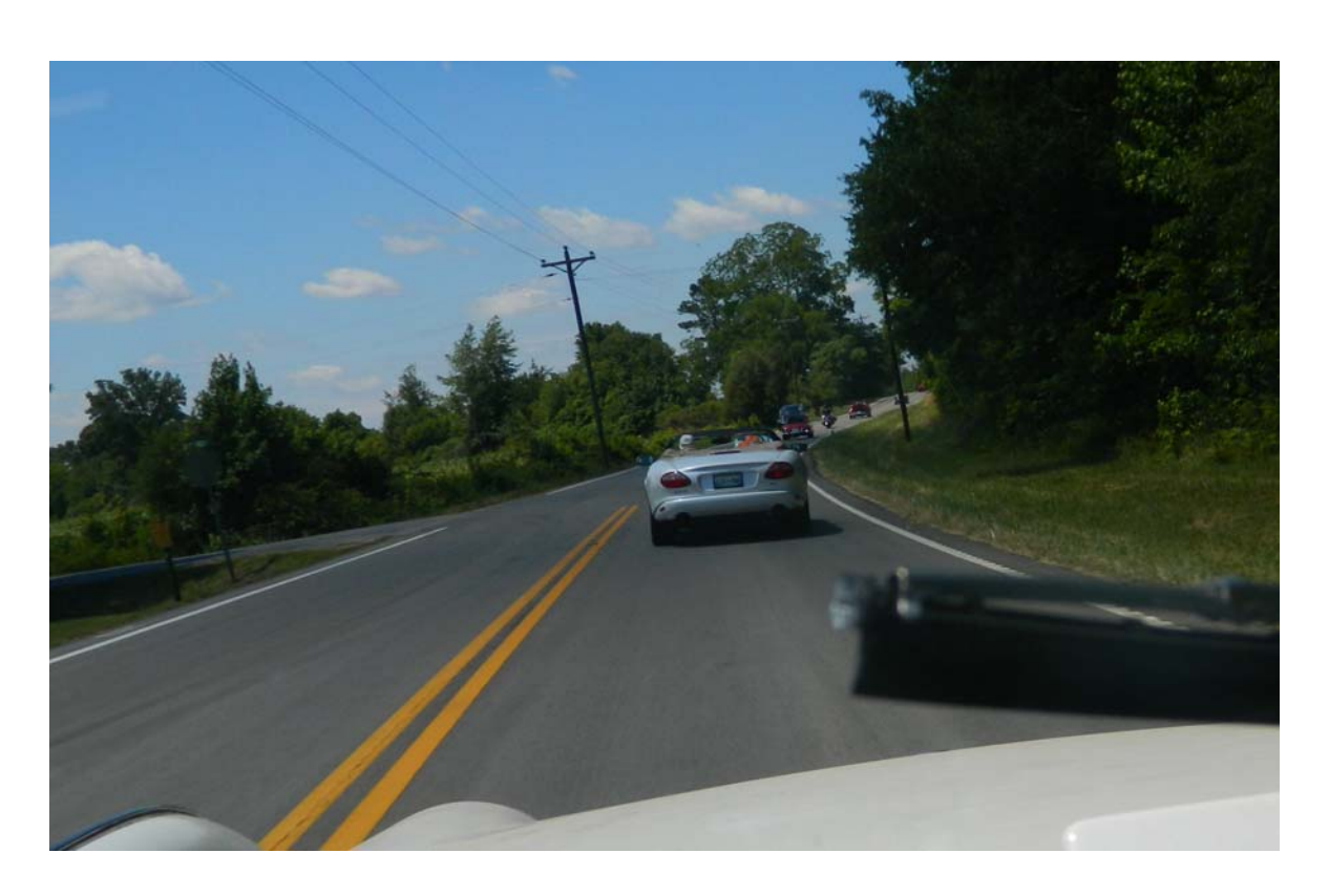
Back on the road to Madison