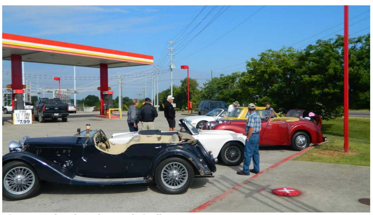
It's going to be a long drive so let's all gas up.