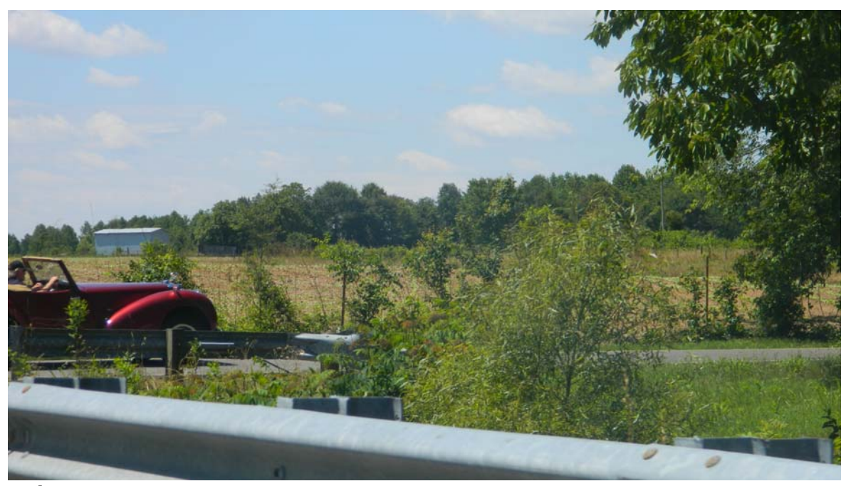
Making a turn