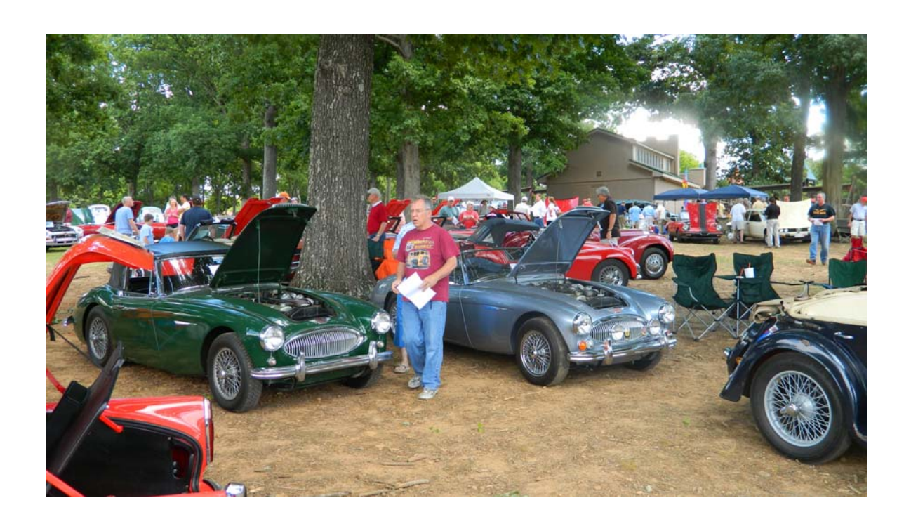
The show venue was great – in among the trees.