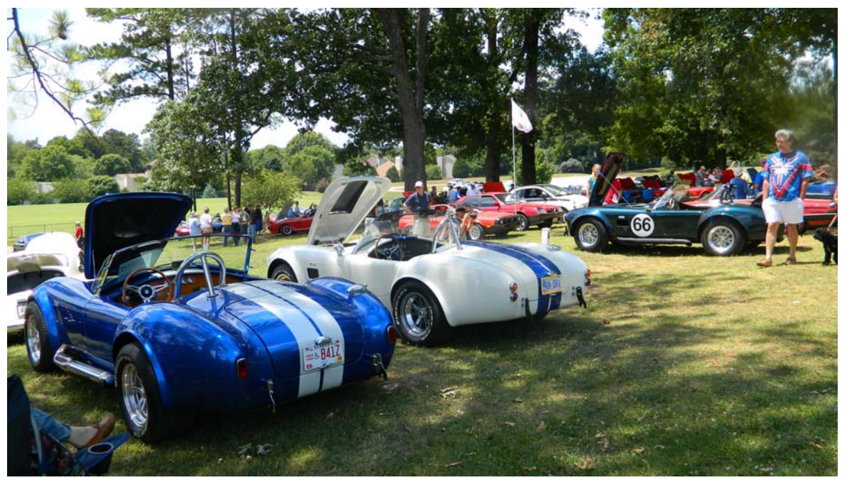
Great shade and a cool breeze on the hillside – someone said a "Chamber of Commerce Day"