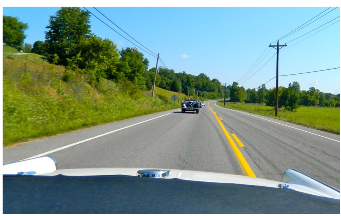
Is that a Riley with no wind screen. Somebody needed some protein for breakfast.